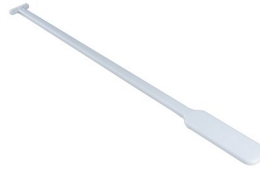
Paddle is included.