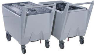
2 Easy Carts are included.