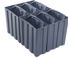
6 Bucket Kit sold separately.